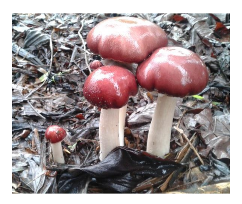
Photo 4 is of a squad of Garden Kings ( Stropharia rugosoannulata ) an import from North America. Edible when young, it is grown in the US among vegetables. If you want to explore mycophagy, the collecting and eating of wild mushrooms, please learn from an experienced person in a face-to-face situation. Depending on the internet for identification is a sure way to grief and tears. I am only concerned that the Garden King will become a weed in Australia ... see photo 5.

The ink-caps usually appear first, they can use the simplest sugars. Photo 1, The biggest fungi fruiting event I've ever seen happened in R and A Smith's wood-chipped paddock. Photo 2, half a dozen, at my last count, species of 'little brown mushrooms' seem to sprout from wet wood-chipped ground only about s ix months after the chips are spread. Photo 3, in this region we have at least 7 or 8 species of stinkhorns, I know you have all smelled them. They too seem to prefer woodchips.