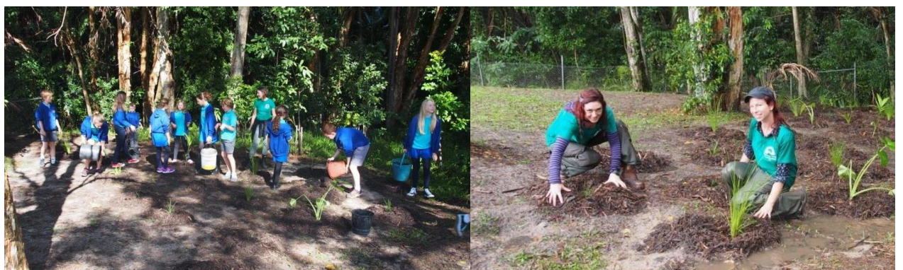
Ocean Shores State School Students and Brunswick Valley Landcare representatives planting natural water filtering system

In summary Splendour in the Grass have contributed to: