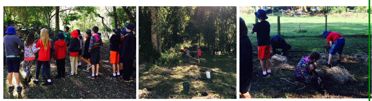
Students of Main Arm State School participating in weed walk and tree planting