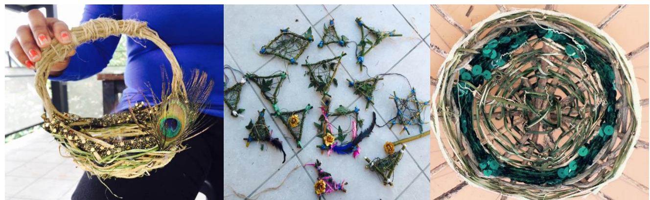
Weaving by Mullumbimby Green Group students

In total the students participated in 18 hours of weed weaving using at least half a square metre of solid weed material every session. The results of these weaving practices revealed a twofold impact. The material harvesting sites have shown vast improvements with significant reductions in invasive species using chemical free harvesting techniques. The more unexpected result was the increased confidence and focus of students. Teacher Pauline Macleod commented every session on the level of student participation and commitment. As students finalised projects they visibly became more confident and felt a sense of achievement after completing tasks they had never done before. Several of the students have become inspired to seek out weeds for weaving and would like to continue the practice.