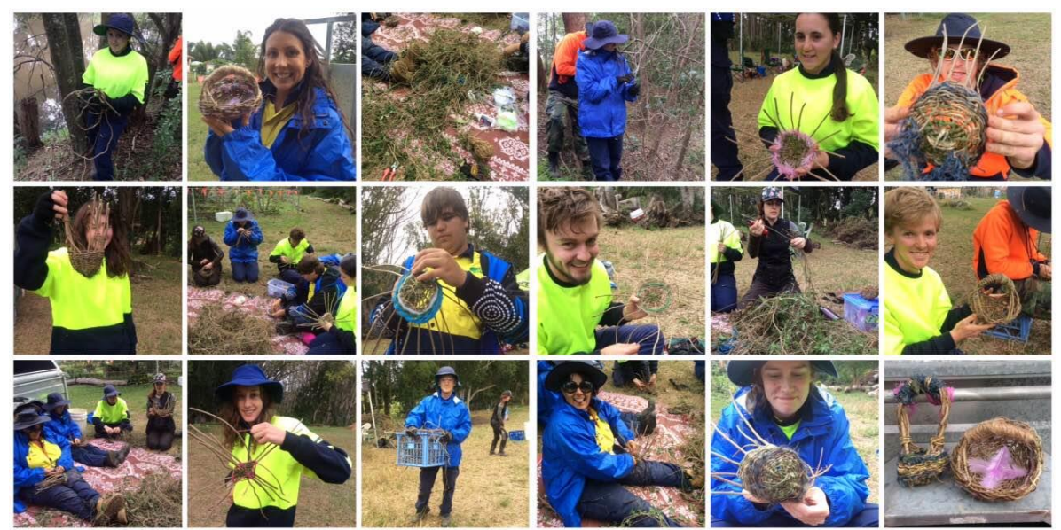
Mullumbimby Community Gardens Green Army team collecting and weaving with weed vines

The team really enjoyed learning how to use common vines species located within their site in a positive and creative way. Many team members are hoping to continue in the industry after finishing the traineeship and found information about projects in the local area very useful.