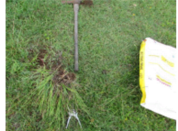
You will need to take these tools: a mattock, secateurs, gloves and feed bags

Bring along a mattock, secateurs and bags for collection. Water, gloves, a hat and closed shoes are recommended as it is a short walk through paddocks to the site.