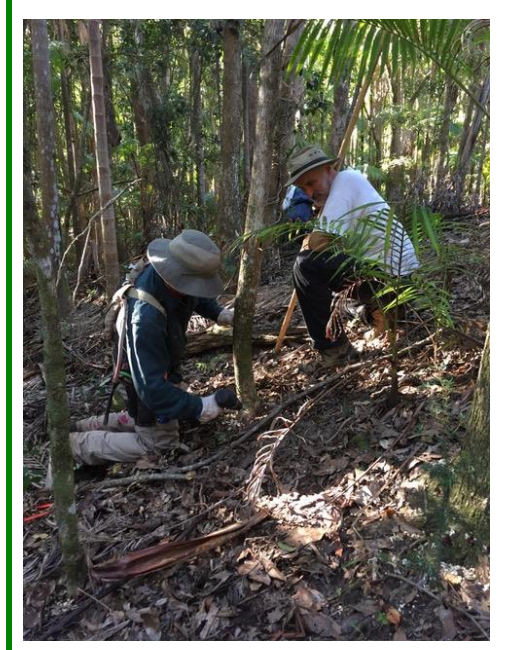
Bush regenerator showing landholder how to drill and inject Cherry Guava

The NSW Environmental Trust funds have been used to employ local bush regenerators to undertake the weed control and planting on the properties.