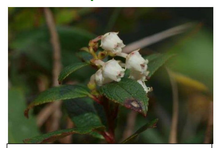
PHOTO: Rare beauty - the Green Waxberry plant.

Botanists from the NSW National Parks and Wildlife Service are going to great heights to identify and record some of the rarest plants in the country.