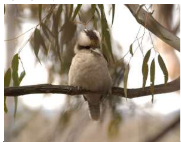
Kookaburras have adapted to become supreme bbq snag stealers.

To read more visit <a href="https://blog.csiro.au/australia-breeds-brainy-birds/">https://blog.csiro.au/australia-breeds-brainy-birds/</a>