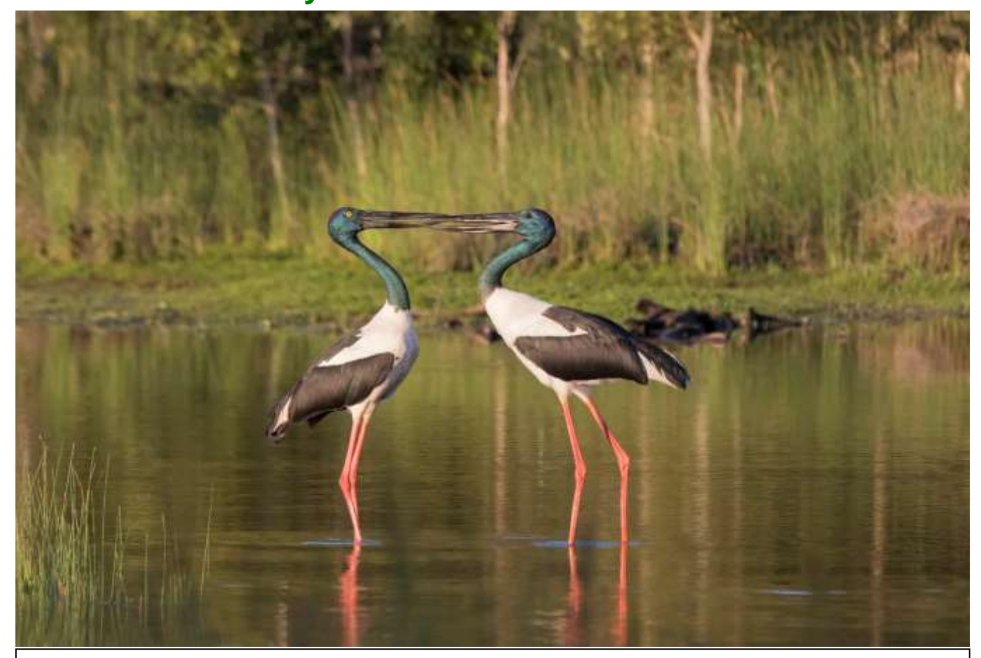
Photo: A Pair of Jabiru's at Byron Wetlands

Thursday 2<sup>nd</sup> February was World Wetlands Day which aims to raise global awareness of the value of wetlands for humanity and the planet. It also marks the date of the adoption of the Ramsar Convention of Wetlands in 1971, in the Iranian city of Ramsar.