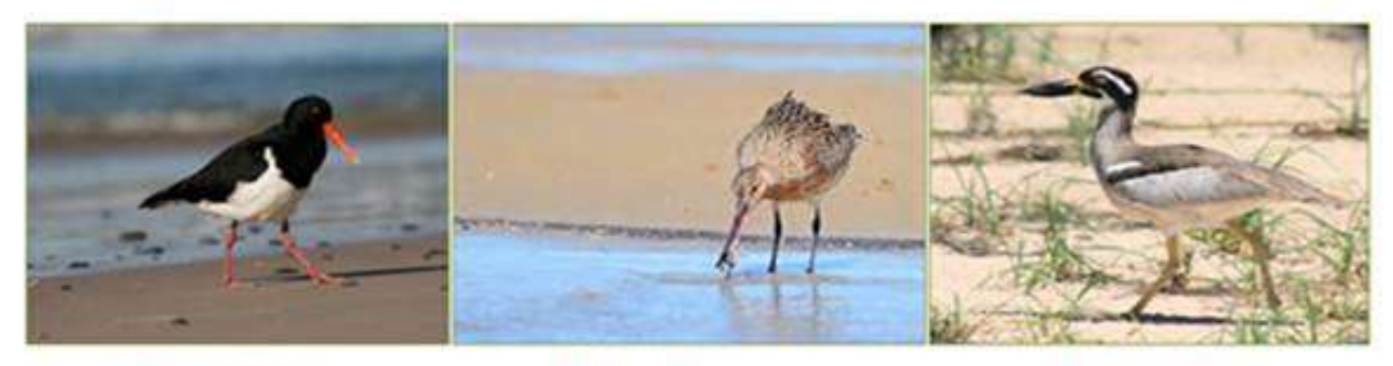
Australian Pied Oystercatcher