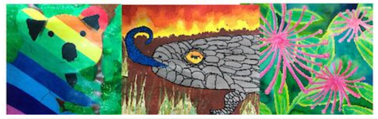
The 2018 competition will be open for entries between 4<sup>th</sup> June and 3<sup>rd</sup> August 2018 Visit <a href="http://www.threatenedspeciesartcomp.net.au/">http://www.threatenedspeciesartcomp.net.au/</a> for more details