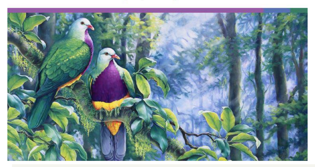
Visit https://www.bigscrubrainforest.org/big-scrub-rainforest-day/ for more details

Sunday 21st October 2018 7am to 3pm, Rocky Creek Dam