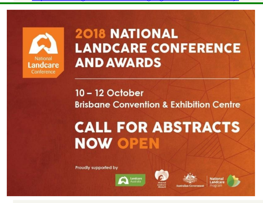
Visit <a href="http://www.nationallandcareconference.org.au/">http://www.nationallandcareconference.org.au/</a> for more details