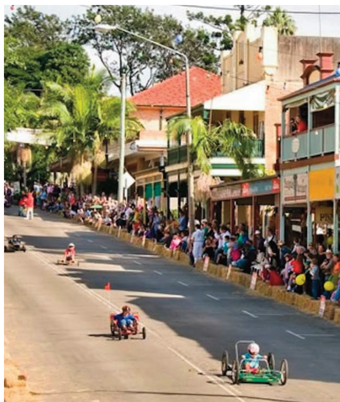
The popular Bangalow Billy Cart Derby