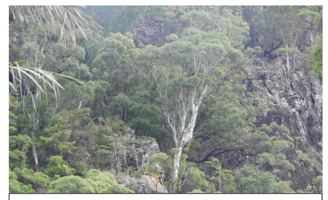
Blackbutt old growth tree on the escarpment adjoining the property

The process is coordinated by the Biodiversity Conservation Trust (BCT) and in the first instance involves a site inspection assessing general suitability for a conservation agreement and the meeting of size requirements as well as biodiversity values. Following the initial site inspection, a site values report is undertaken by industry professionals analysing flora and fauna and the establishment of monitoring stations to measure the effectiveness of subsequent bush regeneration work. A legal document is drawn up and attached to the title thereby establishing the conservation agreement.