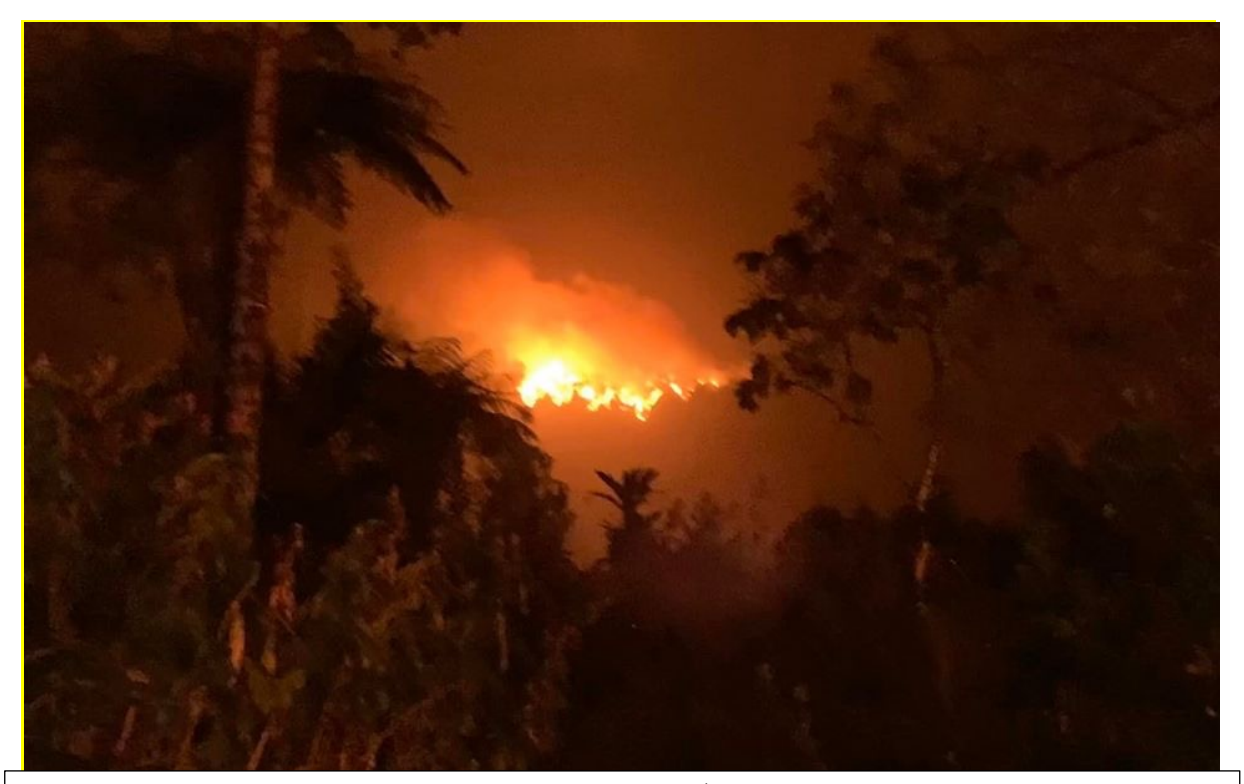
This was the view from our house at 3am on November 9<sup>th</sup> 2019. The lifesavers of the RFS came and backburnt around the house and put out spot fires.

3am November 9<sup>th</sup> the sky was red, embers big as watermelons were raining from the sky. Our fuel shed set alight. We were calm and evacuated without incident, along with most of the valley's inhabitants.