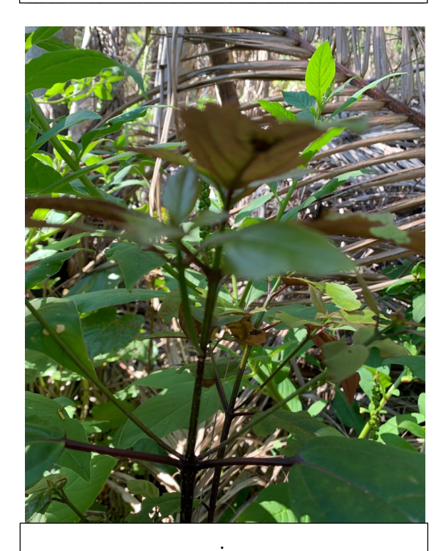
Regen a year on at my height and above