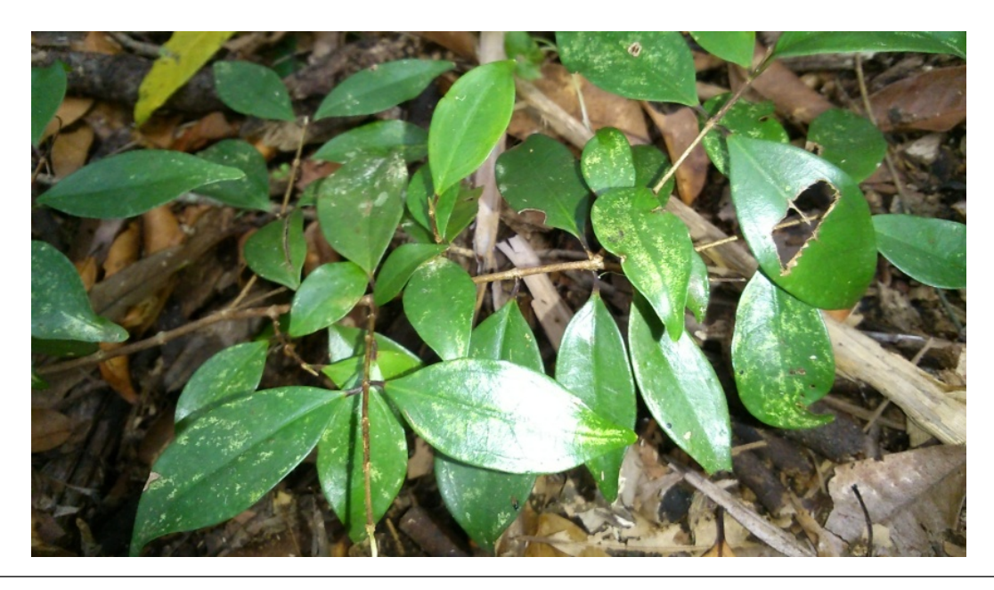
Young Rose Myrtle already showing the tell-tale signs of Myrtle Rust attack