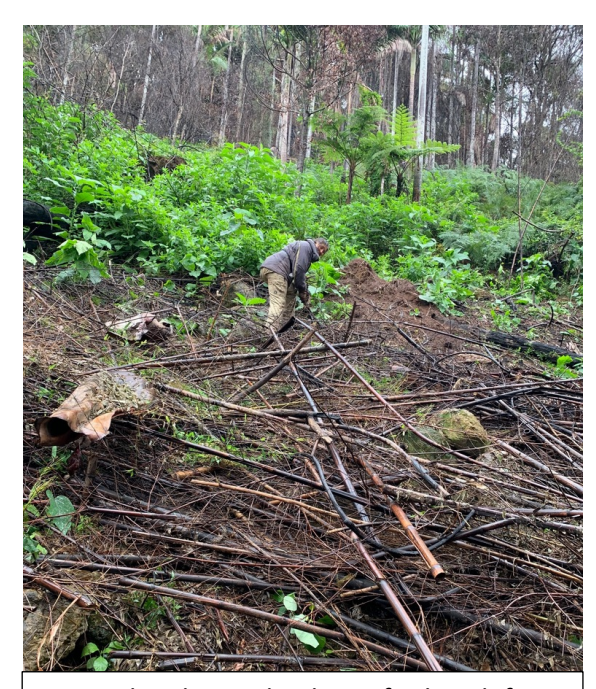
Burnt bamboo – thank you fire! With fire damage above.