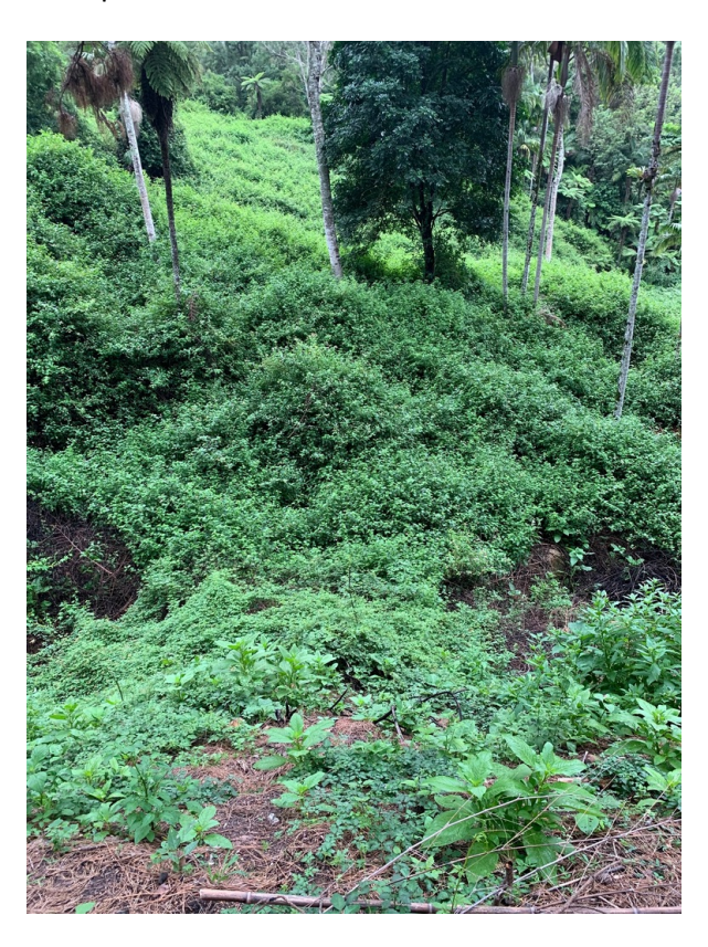
Our first volunteer was a native slender grape vine Cayratia clematidea. This is the burnt slope pictured earlier.

Nature is so generous; she just wants to repair herself. At first after the fires, I wouldn't weed any plant, every green leaf was precious.