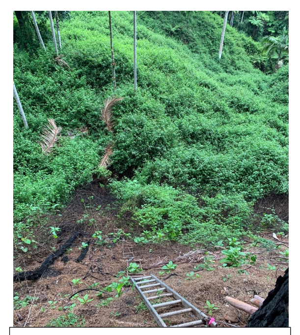
I used a ladder to work on the slope with inkweed dominant and many seedling trees.