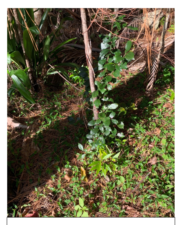
Hard quandong six months after fire.