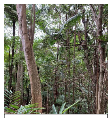
Bush section adjacent to Goonengary National Park

We joined 'Land for Wildlife' shortly after arriving in the valley, keen on developing and improving the habitat values. We then started the conservation agreement process in September 2018 and now in May 2021 we have the agreement in place over some two thirds of the property. Does this 'lock away' the land? Well, yes and no. Yes, where the bush/rainforest areas are situated, creating better wildlife habitat and encouraging plant diversity but no, with the bulk of our cleared land still able to be utilised by us or subsequent owners for a secondary dwelling, grazing livestock, gardens etc. Under the agreement we are required to maintain a level of weed and pest control which would have been part of any land management plan we'd have come up with anyway. In fact ,our advice has now been that a conservation agreement represents a significant investment in the property that would be reflected in its value upon sale!