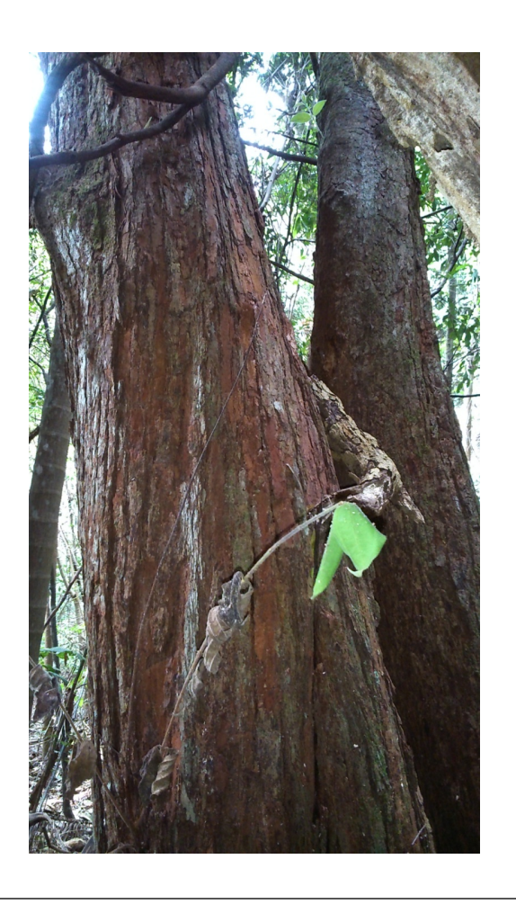
A large Huonbrook Scrub Turpentine, after several years of fighting Myrtle Rust, is putting out epicormic shoots from the lower trunk. This grand tree is in its final stage of life.

This sapling has already lost half its foliage and is unlikely to survive the next year.