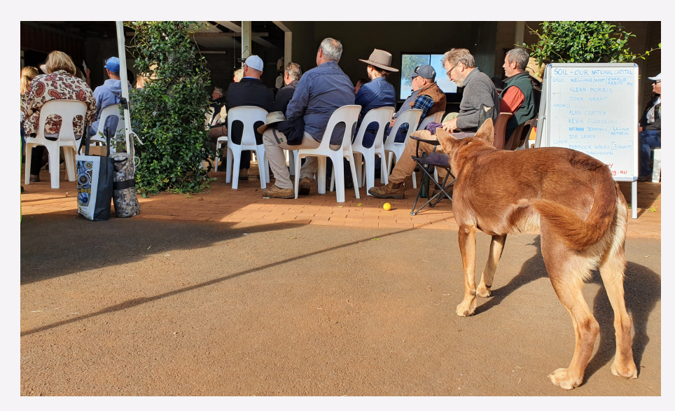
Malua farm mascot