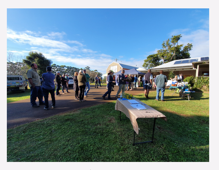
Ross Arnett's "Malua Farm" Lindendale Macadamias with wide rows, grassed surfaces and inter-row cropping, soil testing and insectories.