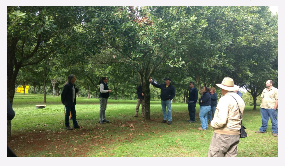
Talking cover cropping and integrated pest management in Macacamia orchards.