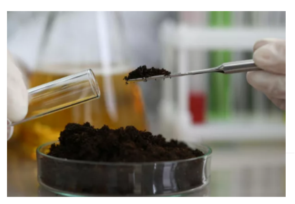
FARMERS TO BENEFIT FROM $200M FED BUDGET ANNOUNCEMENT

As part of the strategy, a two year National Soil Monitoring and Incentives Program will be trialled to improve understanding of Australia's soil condition and assist farmers to improve productivity and profitability. This pilot program will include payments to farmers and land managers to undertake soil testing and capture soil data for the purpose of informing the program, and utilising for their own on farm improvements.