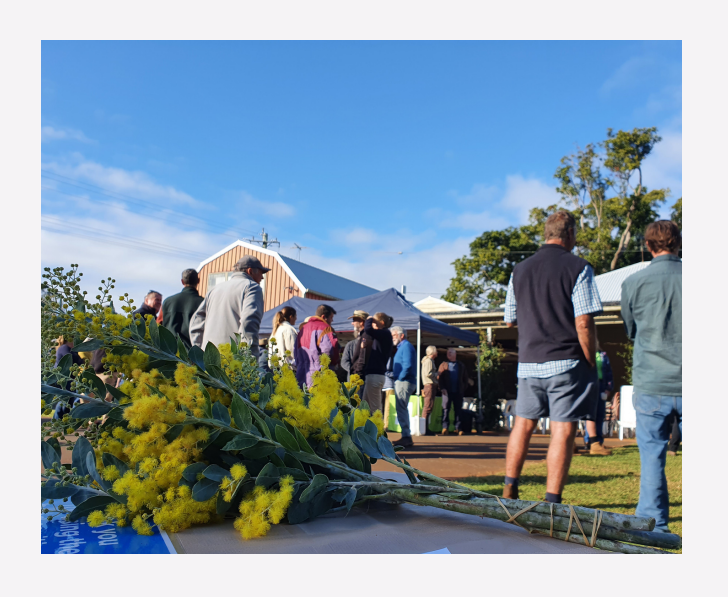
Malua Farm, Lindendale