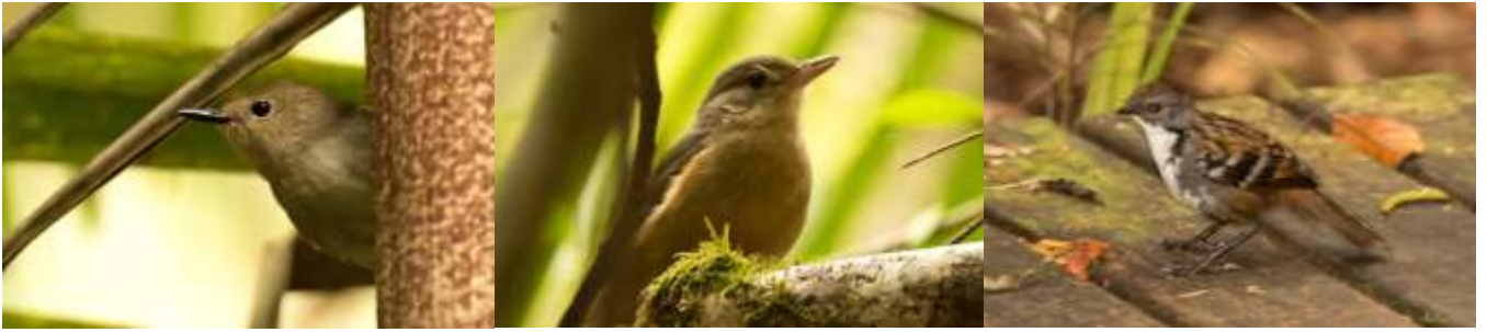
Large-billed Scrubwren, Logrunner, Little Shrike-thrush