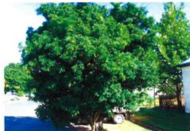
From top: Fine Leaf Tuckeroo, Long Leaf Tuckeroo, Little Kurrajong and Tulipwood.