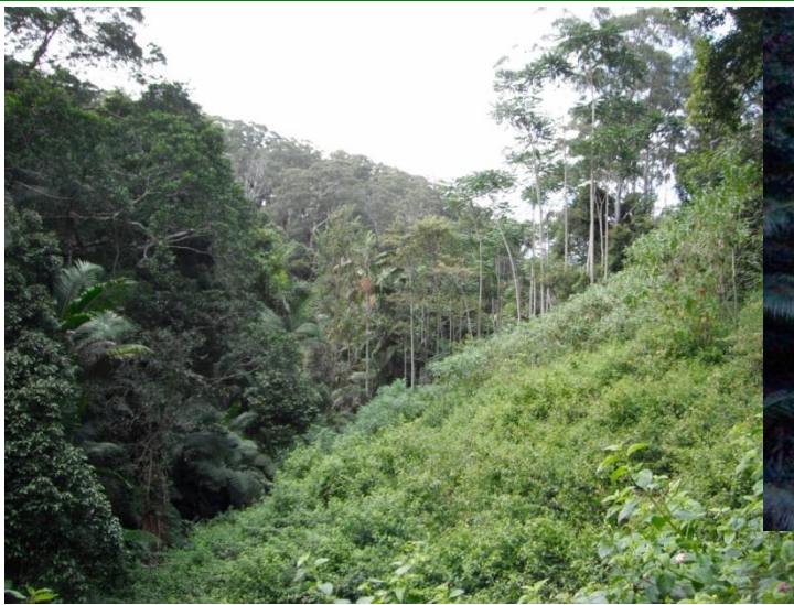
28 th November 2011