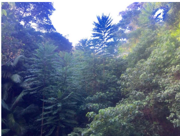
19 th April 2016

These pictures are taken in the Inner Pocket Nature Reserve and demonstrate an “Assisted Regeneration Approach” where nature responds to systematic and on-going treatment of weeds in an area. No planting was required; the bush was just given a chance to restore itself. You can see that within 5 years the forest has been restored.