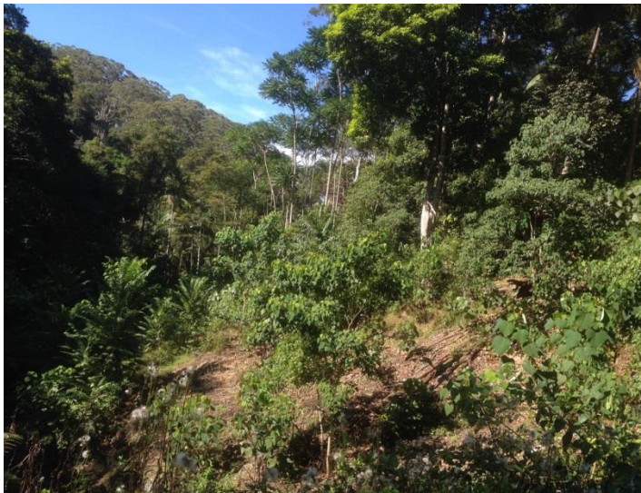
26 th May 2014