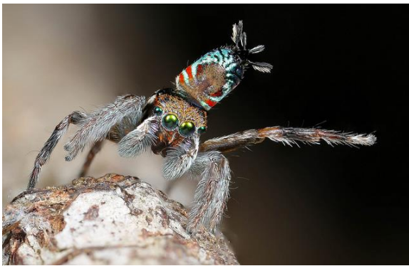
Maratus licunxin