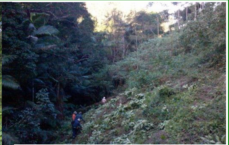
5 th July 2012