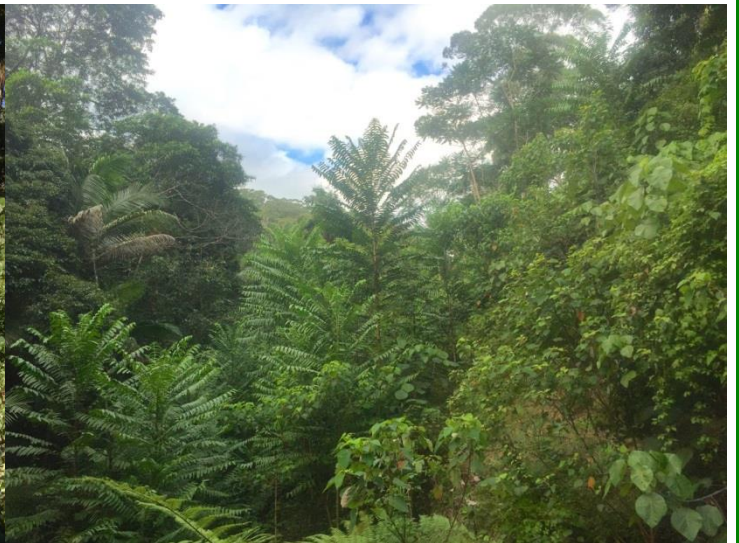
7 th May 2015