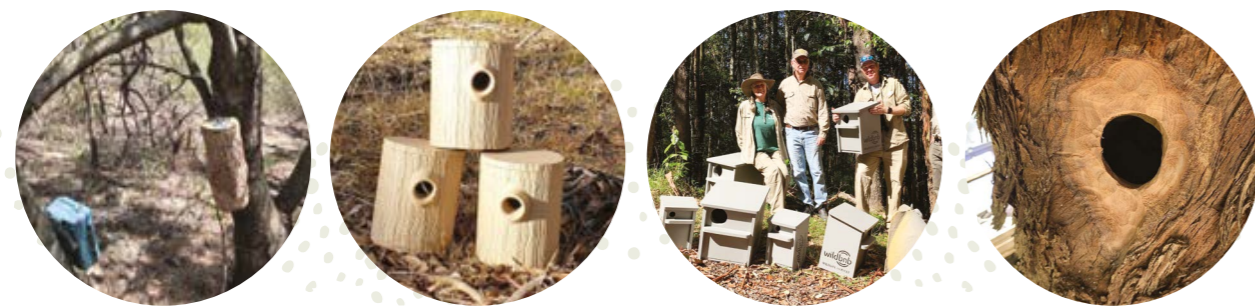
Figure 1: Different forms of artificial habitat. From left; Log hollow nest box and monitoring camera, Traditional plywood nestbox, 3D printed nest box and Carved hollow utilising hollowhog tool.

In scenarios where carved hollows are unsuitable, such as availability of suitably sized trees, or where installation funding is limited, suitable artificial nest boxes are still considered valuable in landscapes with limited natural hollows. These may include hollows made from salvaged limbs, 3D printed or timber constructed nest boxes (Figure 1). Regardless of material, the thermoregulation ability of any externally mounted nest box should be considered a priority, especially as climate change increases the extent and regularity of temperature extremes. Recent trials of expanded plastic nest boxes have shown an impressive ability for internal thermoregulation. As this is an evolving technology, no recommendations of suppliers can be provided at the time of writing, but these alternatives should be investigated when designing a program.